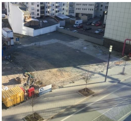
Logistics space Kap Europa View from the top foyer area of Kap Europa