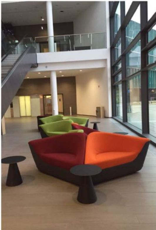
Lounge "Stones" Ground floor E0 Foyer