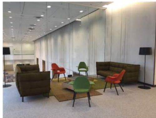
Lounge Level 3 Foyer West and East side

The position of the lounge is fixed and cannot be changed.